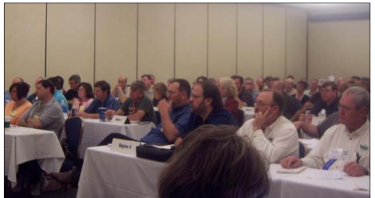
↑ Your LICA delegates address a variety of issues during the 2008 Delegates Meeting, held March 10 in Las Vegas.