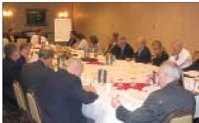
← LICA EVP, second from right, furiously taking notes during the Farm Bill Task Force meeting.

The Task Force defined primary topic areas for more detailed attention and development of options. As a member of the Task Force, LICA's Executive Vice President will participate in developing recommendations for consideration by the NACD Board of Directors in August. These recommendations will be submitted to the Congress to be included in the upcoming Farm Bill. The current farm bill expires September 30, 2007. Congress has begun oversight and field hearings. Legislative action is expected to begin in January 2007.