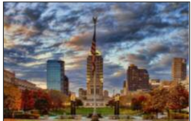
Indiana War Memorial Plaza, on the north side of downtown