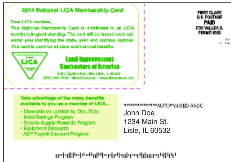
Official LICA Membership Card Back

The member number is on the front of the card and is only good for one calendar year. Each year you will be issued a completely new card and member number, providing LICA receives your dues.