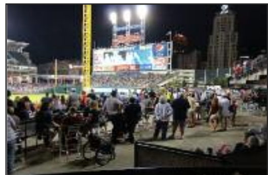
LICA Members at Cleveland Indians Game

Annually National Winter Conventions and Summer Meetings are held throughout the country. They include educational seminars and some are held in conjunction with trade shows; all provide productive, fun outings for members and families.