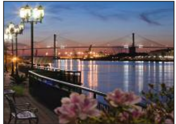
Our hotel is on the world-famous River Street via the River Walk. The Savannah's Talmadge Bridge seen on the riverfront at the Marriott Hotel.

Aside from the many attractions members will see on their own, LICA has wonderful tours planned as well. Tybee Island will be the first stop for members to see dolphins. JCB will be hosting LICA for a tour of their plant and other activities. The LICA Contractor will be hosting the second annual LICA Golf Outing. From a rich history, beautiful buildings, and of course heavy equipment, there is something for everyone in Savannah!