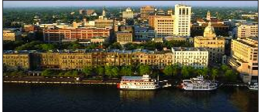
Savannah's Historic District

Savannah, Georgia or "hostess city of the south" has quite a history! It was founded in 1733 and was America's first "planned city" because it was organized into grids. It's no surprise that the cotton gin was created here, considering cotton was "king" in Savannah for many years.