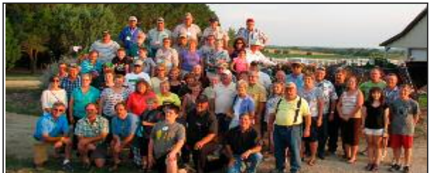
LICA Members at Munson Farms

The afternoon was free, giving the members time to spend in downtown Manhattan, which was a short walk from the hotel. The last night of the week LICA members were treated to a night of old fashioned fun. At Munson Farms everyone got to enjoy horse drawn carriage rides and a delicious barbeque. The 2012 Summer Meeting was entertaining for everyone!