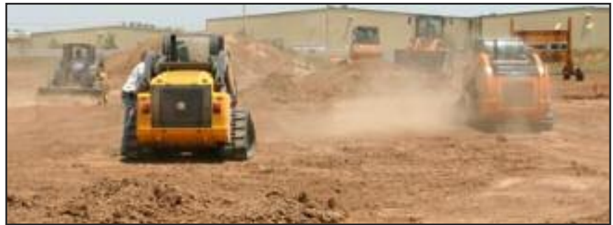
Members demonstrating state-of-the-art Case & New Holland Equipment

The Summer Meeting in Manhattan was a busy one! Kansas LICA pulled out all the stops and put on an amazing week! The week began with several tours including Cat Works, Case, and Landoll for those who enjoy "iron." The other tours tried the local flavor with the Oz Museum & Winery, Flint Hills Discovery Center and a visit to Kansas State University.